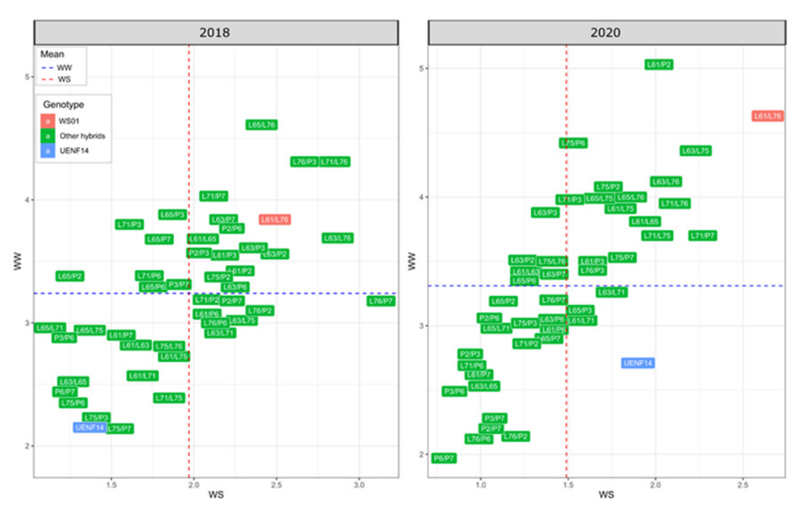
Figure 1. Performance comparison of grain yield (t ha<sup>-1</sup>) of popcorn UENF WS01 hybrid with controls (UENF14 and hybrids) and mean experimental values in crop seasons of 2018 and 2020 under well-watered (WW) and water stress (WS) conditions.

all N doses and locations (Table 2). The UENF WS01 hybrid has an above-average grain yield in both N availability conditions (Figure 2). The hybrid showed N use efficiency and also response to N fertilization and therefore UENF WS01 is considered suitable for both conditions (Santos et al. 2020).