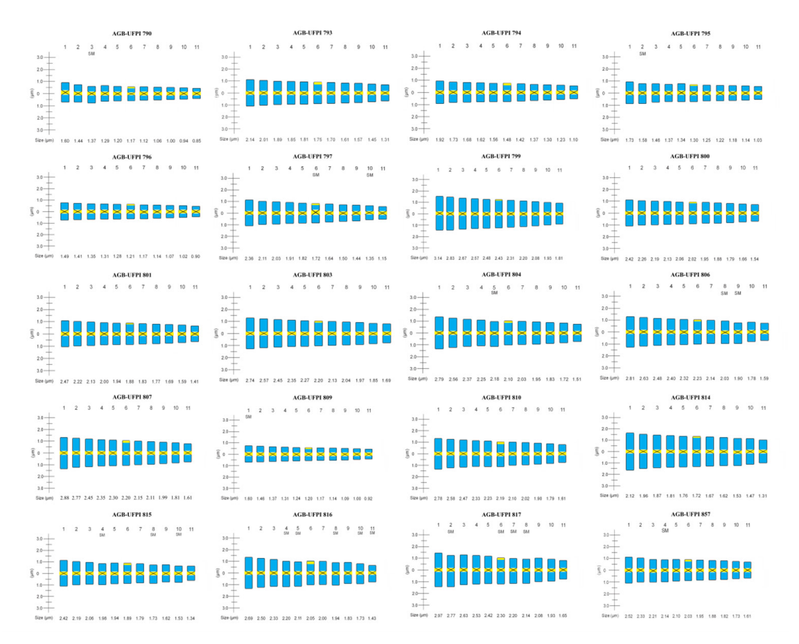
Figure 2. Idiograms representing size, morphology, and distribution of the CMA blocks (yellow bands) located on the chromosome of the P. lunatus accessions analyzed. SM = Submetacentric.

other accessions had the formula 10M+1SM (PGB-UFPI 790, 795, 804, 809, and 857) and 9M+2SM (PGB-UFPI 797, 806, 815, 816, and 817) (see Table 1).