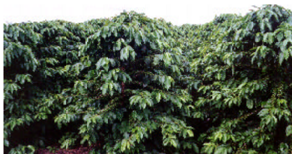
Figure 3 - High density cultivation system