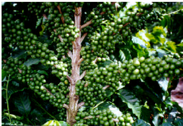
Figure 1 - The genetic potential for yield / plant of coffea cultivars is very high.