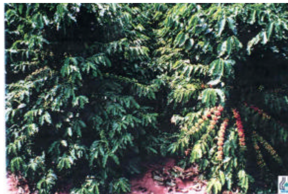
Figure 11 - Cultivars: Left = Catuaí, right = Iapar 59

Quality variability is detected among hundreds of lineages selected from thousands of genotypes derived from germplasms such as Catuaí, Mundo Novo, Icatu, Catimor,