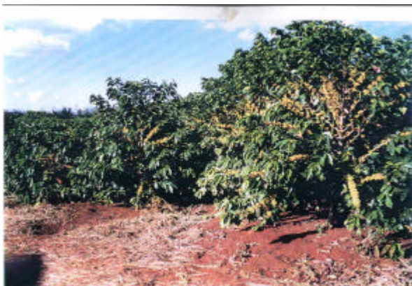
Figure 10 - Cultivars: left = Tupi, right = Icatu Precoce

Late cultivars should be avoided in areas prone to frosts which affect unripe fruits. Yellow fruit cultivars should not be planted on properties that use the manual harvest system for production of depulped cherry fruit, since immature fruits can be confused with yellow fruit at the ideal maturity stage.