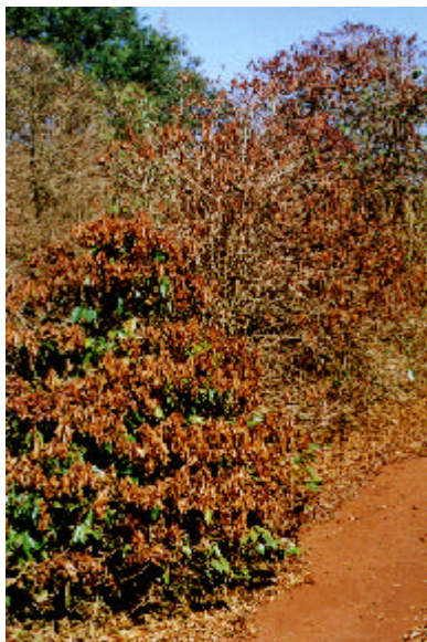
Figure 13 - dwarf cultivar less damaged by the wind frost, June 1994.