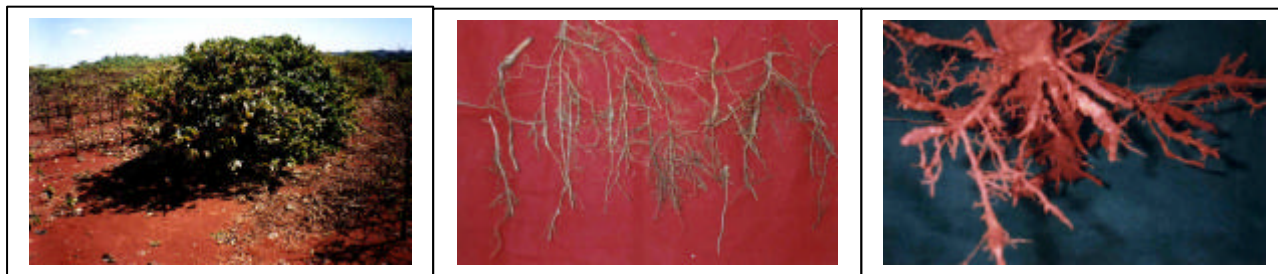
Figure 15 - Left: Cultivar with moderate resistance to nematode M. paranaensis next to highly susceptible lineages. Center: Roots of moderately resistant cultivar at 5 years in highly infested areas. Right: Root system of highly susceptible lineages.

New C. arabica selections with large seeds and early fruit maturity are being developed as C. canephora root-stock cultivars which are resistant to all M. incognita physiologic races (races 1, 2, 3, and 4) and to M. paranaensis . Table 6 shows an example of a breeding scheme developed to obtain root-knot nematode resistant coffee cultivars.