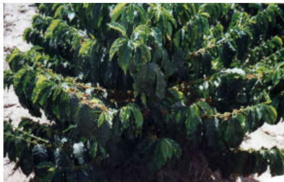
Figure 6 - Selection by index at first flowering