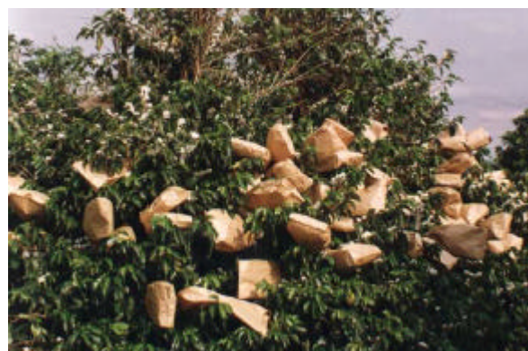
Figure 8 - Manually produced hybrid seeds for small farms.