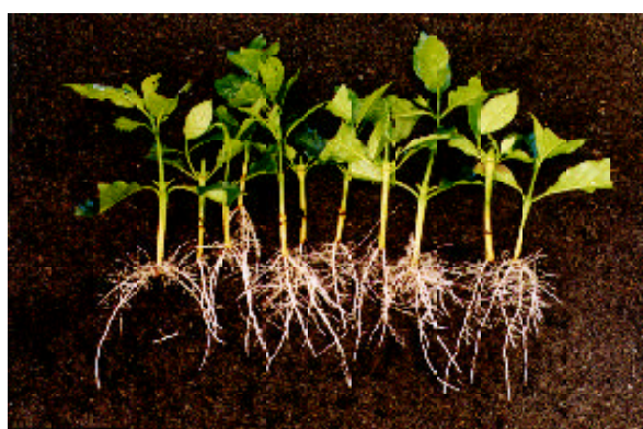
Figure 9 - conventional cloning.