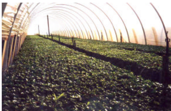
Figure 7 - Reduction of juvenile period in a greenhouse nursery.