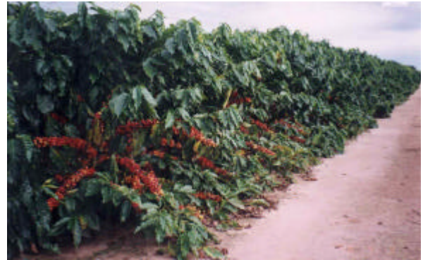
Figure 5 - Selection by index in the 1 st harvest