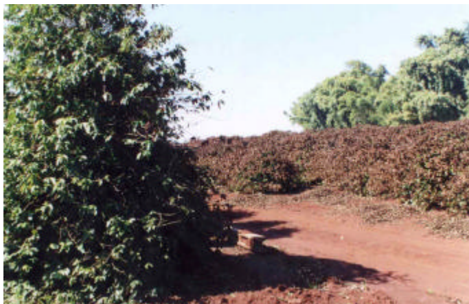
Figure 14 - tall cultivar less damaged by the irradiation frost, July 2000