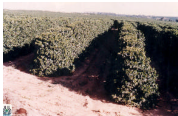
Figure 2 - Wide space conventional cultivation