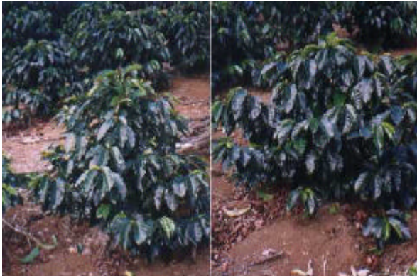
Figure 4 - Juvenile selection in the field