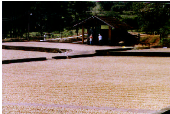
Figure 12 - Echelonned harvest using [early to extra late cultivars] can reduce labor, machine and infrastructure requirements