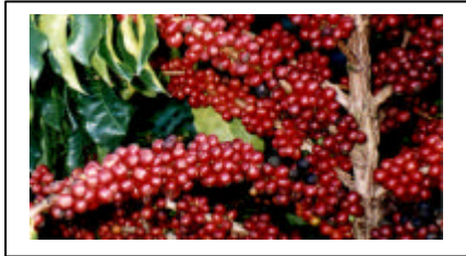
Table 5 - Development of IAPAR-59 cultivar, resistant to Hemileia vastatrix Berk et Br.

IAPAR 59 coffee was recommended for planting in 1993. Its main characteristic is its resistance to coffee rust, which eliminates the need for chemical fungicides in order to control the disease. This reduces costs and avoids environmental contamination.